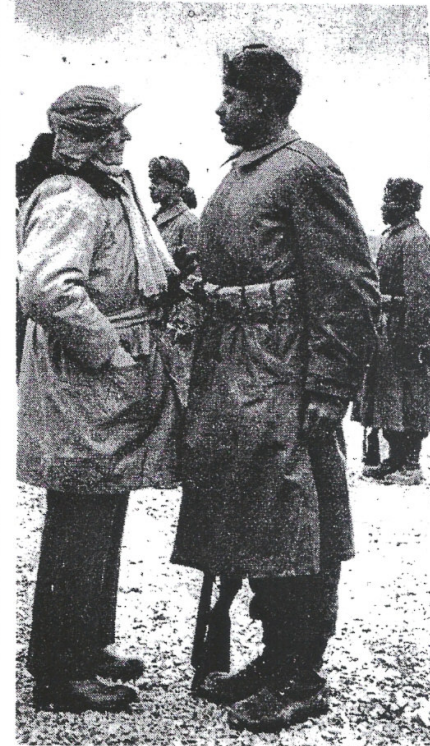
GENERAL MacARTHUR as he reviewed American fighting men in Korea in 1951. "Any man who says that another man's fighting ability can be measured by color is wrong," the general said.