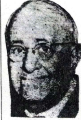
Arthur Spingarn, the man who has been president of the NAACP for twenty consecutive years. The NAACP has never had a Negro president.

New York Minister Malcolm X delivered effective presentations of the teachings of The Honorable Elijah Muhammad on three major radio programs during the past four weeks.