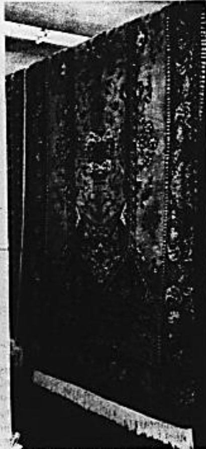
HIGHLY DECORATIVE ancient rug weaving art of Persia, from the district of Qum in Iran. Highly prized collector's rugs for their descriptive floral and animal motifs.