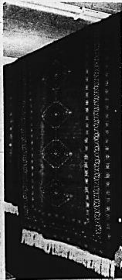
HAND WOVEN 100 per cent wool rugs made in Pakistan of Cakhar-Tribal design, emphasizing rich color contrasts and bold geometric designs.