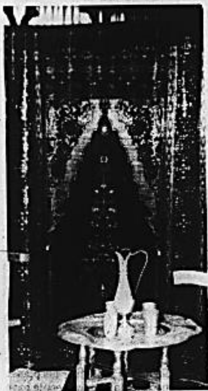
VERY RARE ANTIQUE pure silk Tabriz Persian rug, approximately 100 years old. Hand woven in Banderma, Turkey by a tribe devoted only to weaving silk rugs. A worn spot appears at the upper eye level which depicts the many times devotees prostrated touching the head to the silk fibers five times or more per day at time of prayer.