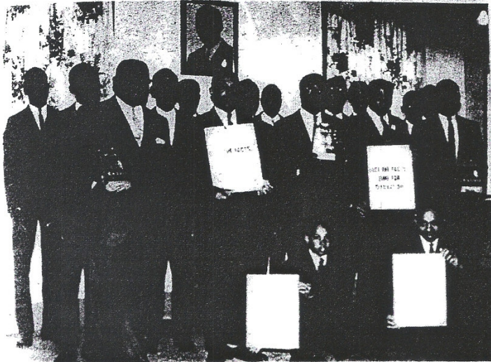
DEVOTED FOLLOWERS of Messenger Muhammad in Flint, Michigan, are these Fruit of Islam members, shown here with copies of "Message To The Black Man In America"

and "Muhammad Speaks" newspaper, which they have been instrumental in raising the sales of in and around the Mid-western city.