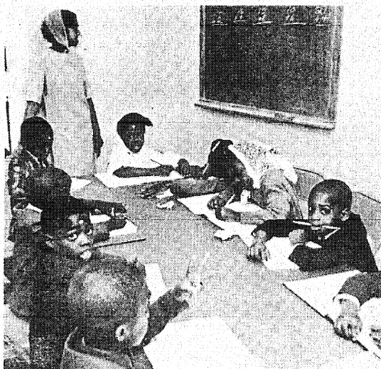
BRIGHT UNIVERSITY students bear down on lessons under guidance of Muslim instructor. Accepting non-Muslim students who have attended Mosque, as well as Muslims, the Boston school has aided pupils in the public system.