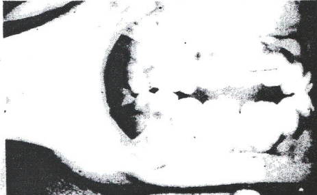
THUMBSUCKING prevents the teeth from coming together due to the constant insertion of the digital member.

In the meantime, look at the illustrations included herein. One shows the malformation of the teeth due to tongue sucking, another due to lip biting and a third from thumbsucking. If any of these habits are detected and corrected at an early enough age, the incorrect alignment of the teeth may correct itself. All of the illustrated cases had to be corrected by means of special dental appliances.