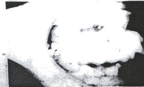
LIP BITING also brings malformation of the growing teeth. Note the space between the two upper teeth.