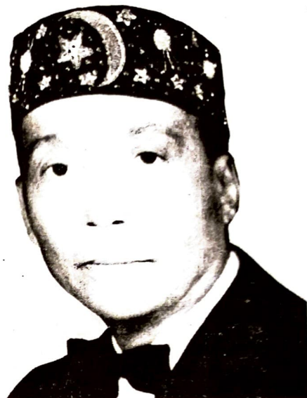
The Honorable Elijah Muhammad Messenger of Allah.

THE wickedness of the people today, is such that they have no respect for Righteous, Truth, and Justice, for the wicked want to claim that all people are the same as themselves. The wicked have no