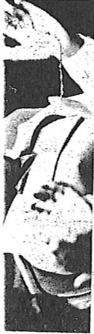
ATTENTIVE, APPRECIATIVE Black students respect not only their elders, but one another, as they give warm applause for the efforts of fellow students.