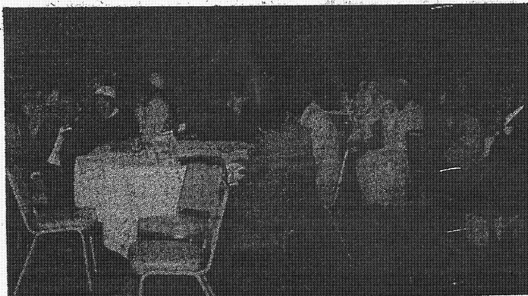
PART OF LARGE crowd attending recent fashion show and dinner to benefit Sister Clara Muhammad Elementary School held at Newark N.J. elegant Robert Treat Hotel. Affair was sponsored by the combined committees of Mosque No. 25.