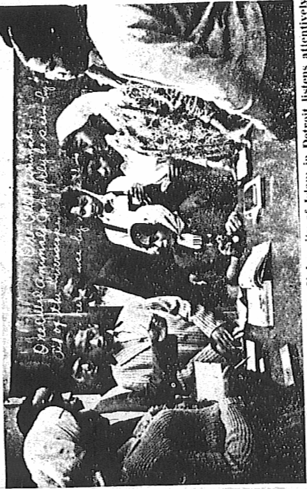
HIGH SCHOOL STUDENTS at University of Islam in Detroit listen attentively to discussion of one-called animals in biology class. Muslim school is accredited.