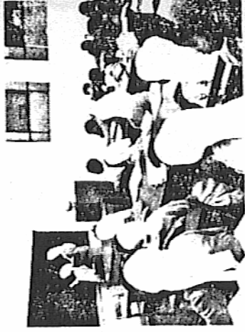
FIFTH AND SIXTH graders get their lesson in arithmetic, and watch as teacher and pupil work on blackboard problem.

VISUAL TOOLS are generously used by instructors to get lessons across to pupils at the Detroit Muslim school.