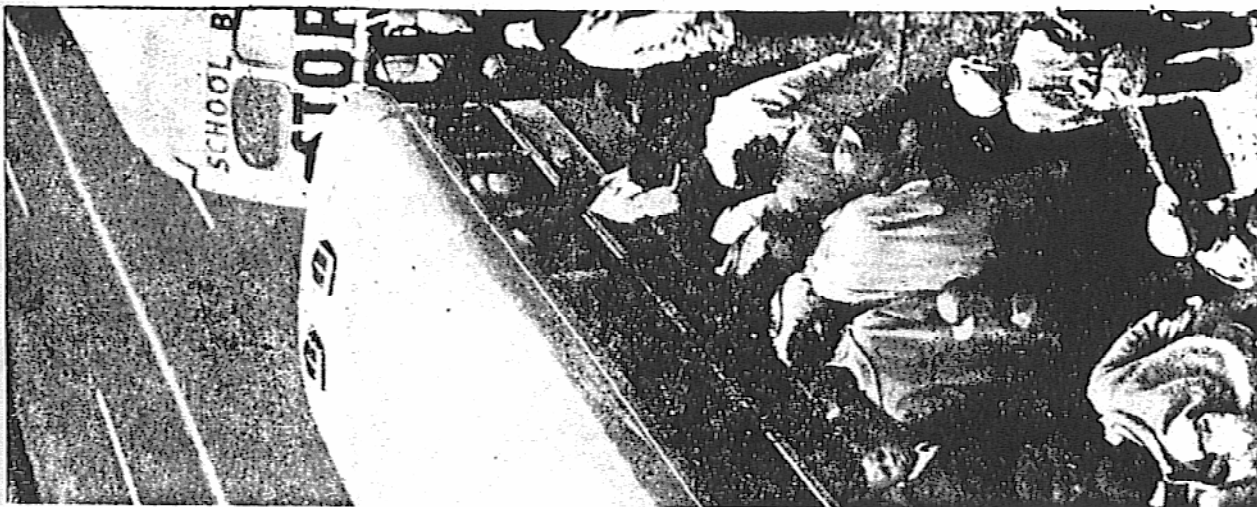
MUSLIM-OWNED BUSES provide transportation for students to and from University of Islam. Vehicles are clearly identified as school buses.