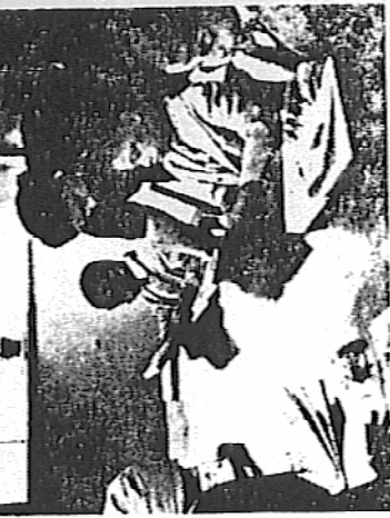
DETROIT SCHOOL goes to 10th grade, and is accredited to 12th. They get same national holidays as public school.