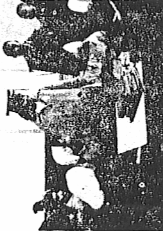
SENIOR HIGH students talk about everyday teenage topics after lunch in Temple No. 1 Luncheonette next-door to school.

WHILE MUSLIM students are in school 50 weeks a year, they get a vacation during the last week in June, and again toward the end of February — which is the time of annual convention of Muhammad's Temples of Islam. Promotions come in June and February of each year.