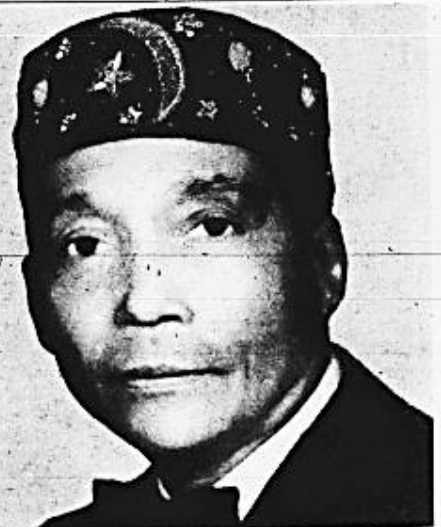
Messenger Muhammad Speaks:

Special Film Highlights New York Benefit For Muhammad Universities of Islam