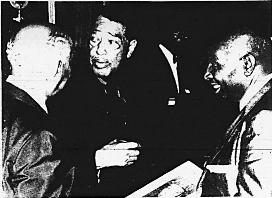
WORLD-FAMOUS conductor Duke Ellington (center) discusses Messenger's Program.