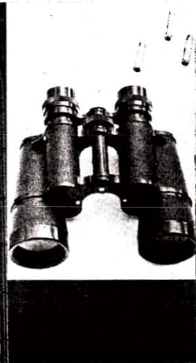
would-be assassin who left behind tell-tale box of .38 caliber bullets and high-powered binoculars.