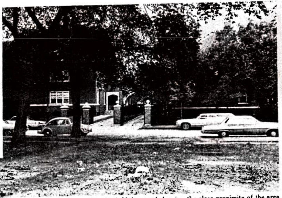
VIEW FROM THE front entrance of the residence of the Honorable Elijah Muhammad showing the close proximity of the area (now cleared) where assassin lurked. Binoculars and some of the .38 caliber bullets (inset) were found after would-be murderer abandoned his hideaway.