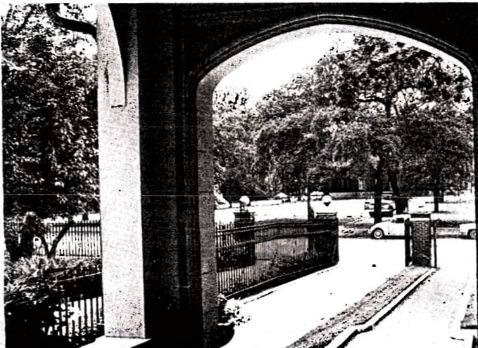
THIS LOT, directly facing the front entrance to the Honorable Elijah Muhammad's residence, just cleared of dense foliage, hid