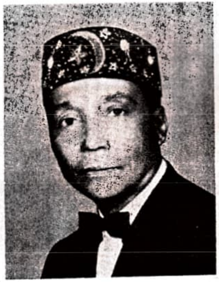
The Hon. Elijah Muhammad