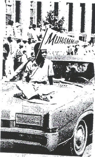
Scenes from Patriotism Day Parade show Chief Imam and son (above), Pioneers riding float dedicated to the U.S. Constitution and the Bill of Rights (lower left) and other participants.