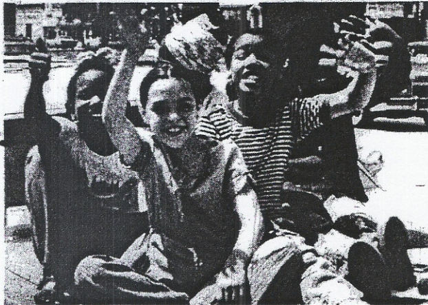
MEMBERS FROM THE cast of "The Oz" wave to on-lookers along the parade route.