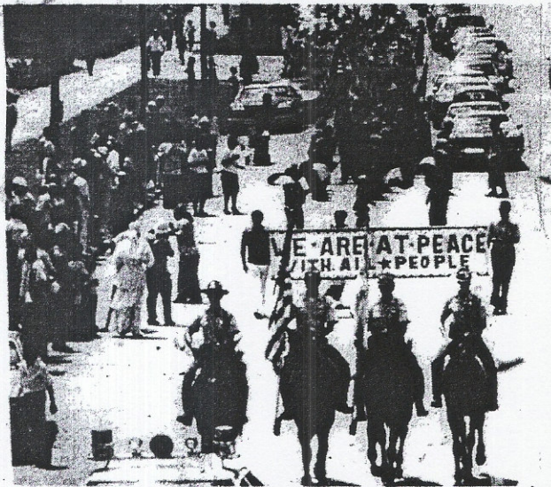
FOR AS FAR as the eye can see the street was filled with parade participants as shown here passing reviewing platform.