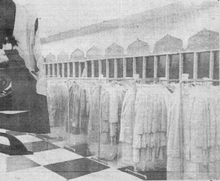
Finished regulation MGT garments, and the popular Walking Suit, hang in magnificent finished display of sunburst postels.