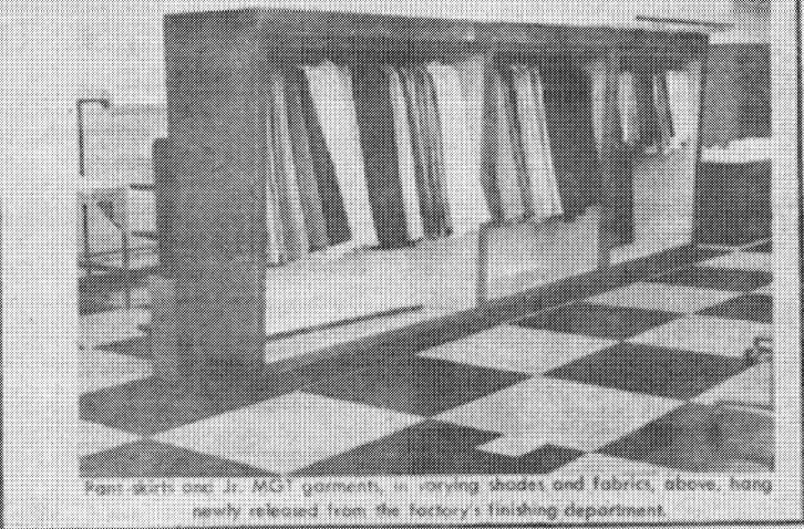
Past skirts and Jr. MGT garments, in varying shades and fabrics, above, hang newly released from the factory's finishing department.