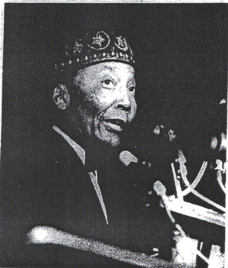
EMPHASIZING POINT, the Honorable Elijah Muhammad—the only Divinely-Missioned leader of America's 25-million black people—addresses huge gathering at Phoenix, Arizona's ultra-modern Convention Center.