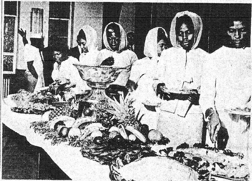
SUMPTUOUS BANQUET highlighted festivities at Elijah Muhammad's University of Islam in Chicago during luncheon for 1967 graduating class. Leading young women who

HE HAS urged all black women to come into the Nation where they too will find serenity among their own and freedom from frustrating the attempts to get on board the sinking ship of the white Western world.