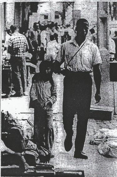
NATURAL FRIENDS, Black soldier on leave in Saigon takes Vietnamese child shopping. In Saigon, as in every country occupied by U.S. troops, Black soldiers are highly favored over their white counterparts from America who invariably have attitudes of superiority and look down on peoples of other nations.

NAME _____ (PLEASE PRINT) ADDRESS _____ CITY & STATE _____ ZIP CODE _____ DON'T DELAY — MAIL TODAY! BE AMONG THE FIRST TO SHOW YOUR GOOD INTENTIONS. FIRST 50 ORDERS RECEIVE 2 FOR 1.