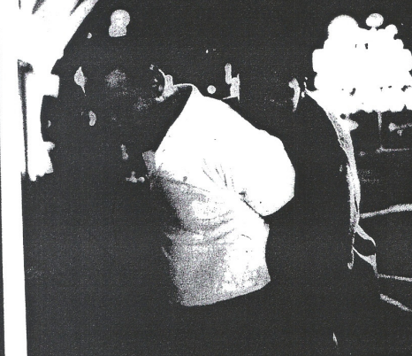
WITH THE TWINKLING NEON LIGHTS of Las Vegas in the background, Joe Louis, the old "Brown Bomber" of boxing, and Muhammad Ali, the present champion of the heavyweights of the world, tussle playfully in a parking lot.

"Negroes have made, as everyone knows, tremendous contributions to boxing during the past decades, not only as fans but as world champions, main contenders and chief drawing cards in every division—yet, there has been no company formed in which they played key roles."