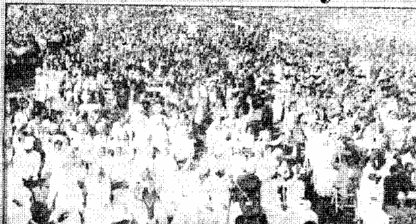
Howe your head if you believe Muhammad is TRUE leader for Black people.