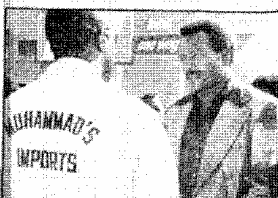
Film star Jim Brown, 'Honor and respect' to Messenger Muhammad.