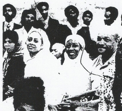
PROUD AND PLEASED spectators show their feelings as Chief Emam Wallace D. Muhammad delivers Survival Day address.