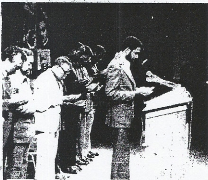
CHIEF EMAM Wallace D. Muhammad (second from left) joins nearly 4,000 followers at Chicago's Civic Opera House to conclude his historic series of "Ethnic Survival Week" lectures.

"Sometimes we go out and God has blessed us more than we knew.