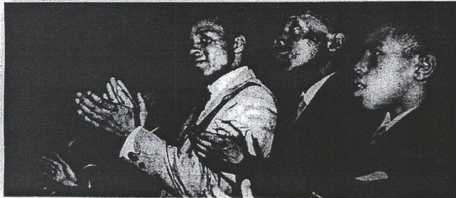
WARM APPLAUSE constantly interrupted the speech of the Honorable Elijah Muhammad as a great surge of visitors and guests swelled Savior's Day Convention in Chicago.

While 1966 is the beginning of the end for some, for our people who join the Messenger of Allah, it is indeed the beginning of a new life. This was the message brought to black America and the world by the Honorable Elijah Muhammad on the event of the momentous Savior's Day.