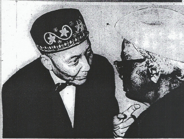
MUHAMMAD'S KEEN interest and concern in the elderly as well as the youthful, reflected in the above meeting with woman who came to shake the Messenger's hand at the end of Saturday's meeting. Thousands of black people had come out to hear Muhammad for the first time in their lives.