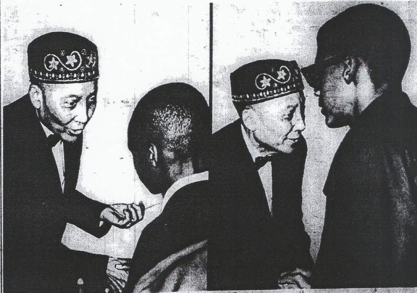
THE HONORABLE ELIJAH MUHAMMAD, personally greeting hundreds of new converts to Islam, as they came to the platform following the meeting. An audience of more than 7,000 heard the Messenger of Allah on Sunday in a meeting remarkable for its intense interest and decorum.

ed an er-nt, tips in al-byng ed nic al-tal is of the rnter of of mer-to hat er- ad ec-ize on-ex-ad Na- ion ent des of 0 um-the 194. of eau This men tion in- 8.7 960. nted men ula- was said. 5 1966 o. 2 60617