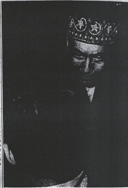
YOUNG AND old alike are cheerfully greeted by the Honorable Elijah Muhammad. Here he answers a question for an inquisitive youngster concerning the topic of his recent lecture.