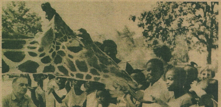
YOUNG BLACK children of St. Louis' "Operation Champ" visited Jeep, the giraffe, at his home in the zoo to feed the animal leaves.

had to endure the rigors of a city ghetto. The statement made headlines and in the face of the inevitable repercussions, Mr. Humphrey backed away a bit to "explain" what he really meant.