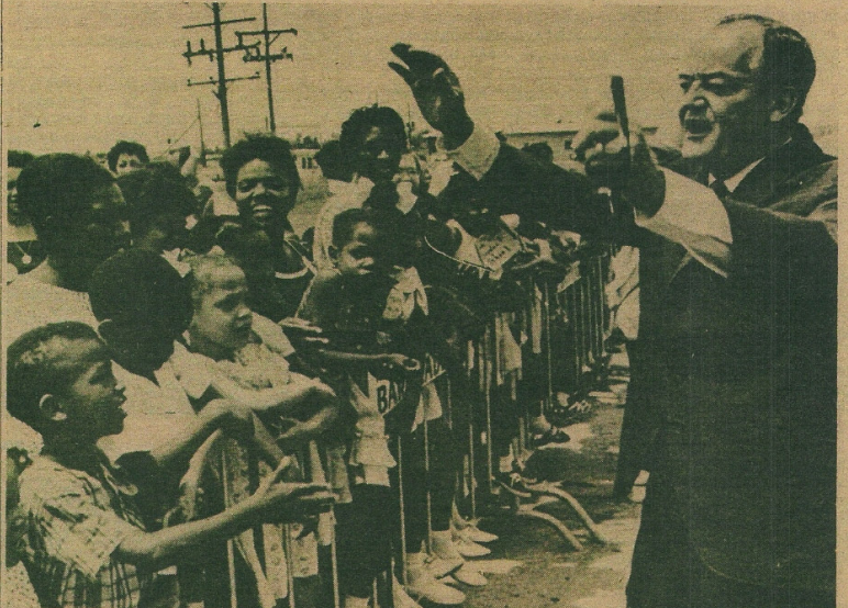
TOUCHED BY the crowd of friendly black children from the ghetto of New Orleans who greeted him when he arrived in the Louisiana city, Vice President Hubert Humphrey later told a conference that he, too, might "lead a mighty good revolt" if he and his family

children, with the promise that permanent pools will be built and serviced. This was one of several minor concessions made by the city to head off further rioting.