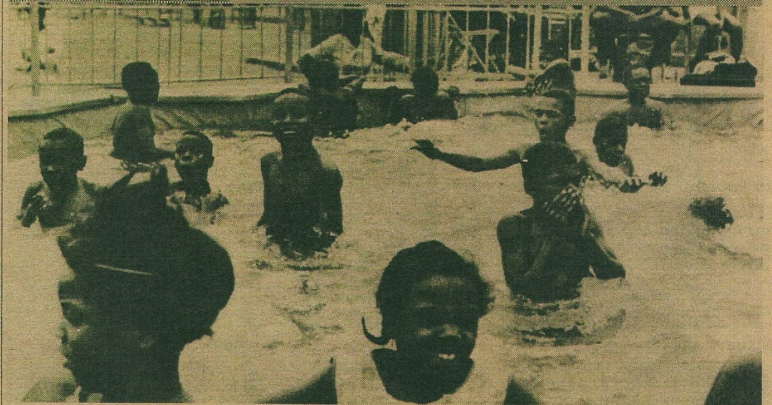
WHEN NEGRO'S discontent with his assigned place in the American plan boiled over into a riot on Chicago's West Side, the mayor hastily authorized the installation of temporary swimming pools in the ghetto for black

children, with the promise that permanent pools will be built and serviced. This was one of several minor concessions made by the city to head off further rioting.