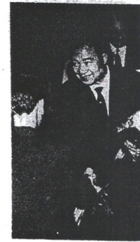
ONE OF THE MOST controversial leaders of an Afro-Asian nation of modern times is Prince Norodom Sihanouk of Cambodia, seen here entering Cairo airport during recent conference of non-aligned nations. Once regarded as safely in the vest pocket of the West, Prince Sihanouk's position has become one of disenchantment with the Christian West.