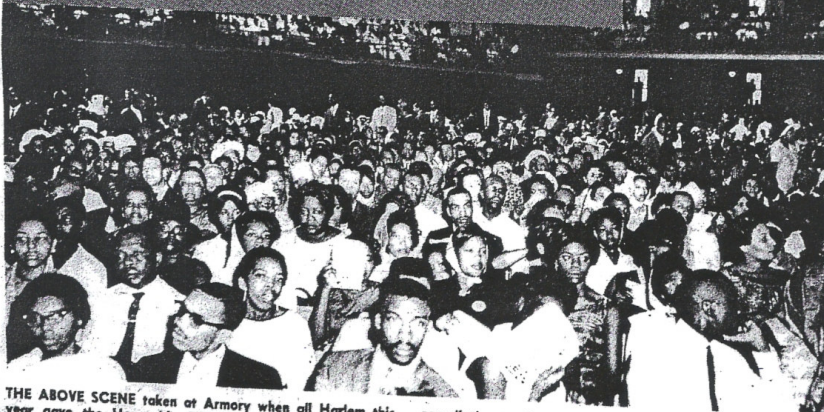
THE ABOVE SCENE taken at Armory when all Harlem this year gave the Honorable Elijah Muhammad the greatest welcome given to a black leader, was the most shocking

repudiation to threats and claims made by disgraced hypocrite Malcolm Little.