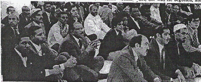
INTERNATIONAL MUSLIM Community congregate during the Eid-ul-Fitr commemoration, marking the close of the Holy Month of Ramadan.