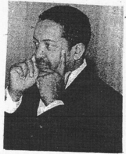
The Honorable W.D. Muhammad Supreme Minister

We have the unfailing knowledge of Divine Mind to raise you up into manhood