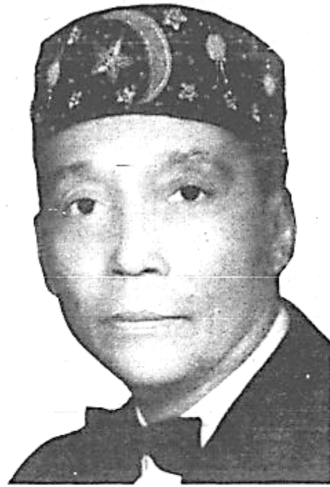
The Honorable Elijah Muhammad Messenger of Allah

SO we, the Original Black people were by-passed and their (white scholars of Islam) brother, the American white people, were opposed to them and the white American would send them back where they came from to prevent them from trying to teach his Black slave, Islam. The scholars of Islam knew that once Islam came to the Black slave the white man could not rule his Black slave any longer. Islam would give the Black slave the power to oppose the white slave-master and Allah Would be the Master of the Black slave and not the