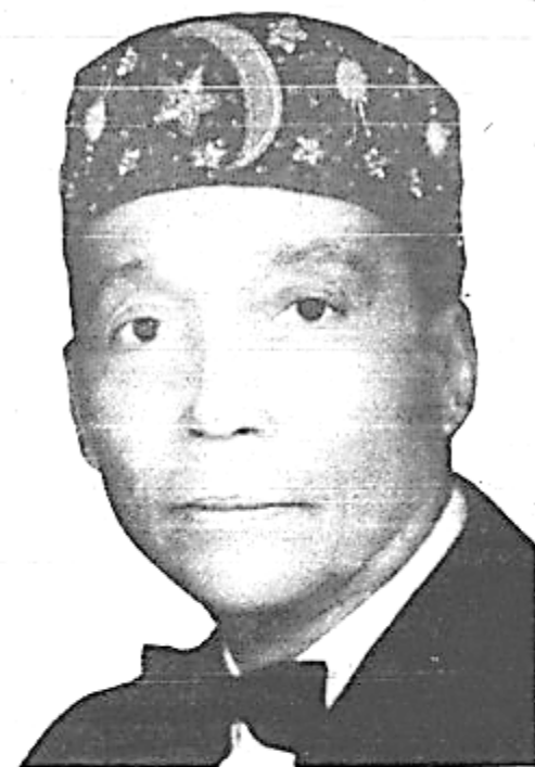
The Honorable Elijah Muhammad Messenger of Allah

IT IS we, the Black People who have disobeyed our God Allah. 'So, let us set our face for a religion that is the right state,' Islam — a religion that we will be rewarded for worshipping the God of that religion, Allah. We have actually lived in hell and caught hell, daily, for living in