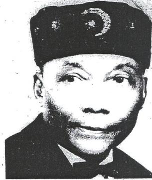
The Honorable Elijah Muhammad

MR. YAKUB'S made-man (white race) is the people that started fighting to appear among us. I do not care if you read of fighting among the Black Nation, four thousand (4,000) years ago. The white race is the real cause of it. PLAYING WITH STEEL.