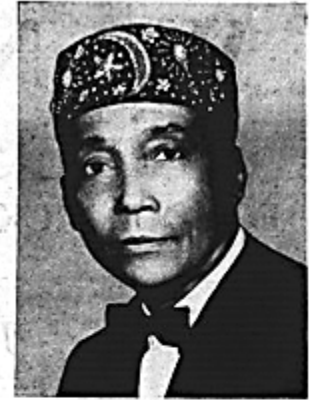
The Honorable Elijah Muhammad Messenger of Allah Muslims reserve all rights. Photograph cannot be reproduced without permission of owner.

THE WORLD mistreats the righteous because the world is against the way of righteousness. There are some preachers going around now — as long as the white man says that the preacher should not follow Elijah Muhammad — the preacher goes around for the joy of