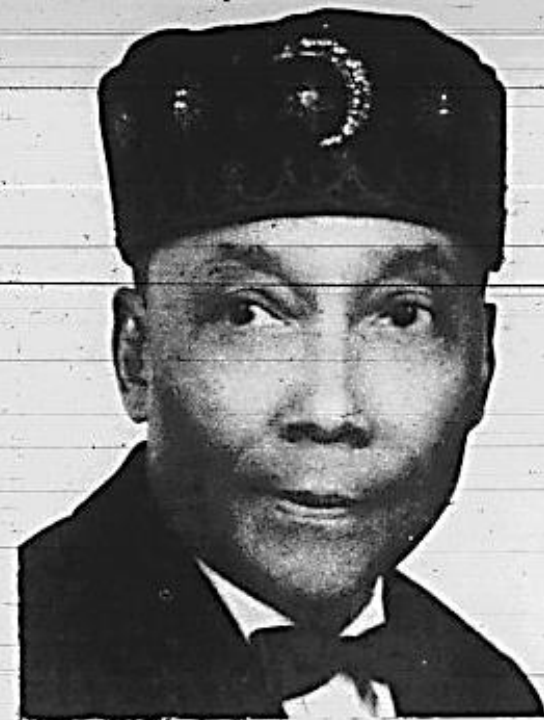
Elijah Muhammad Messenger of Allah

THE SIGNIFICANCE OF THE MOON . . . TO BE CONTINUED NEXT WEEK.