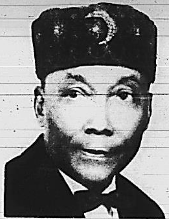
The Honorable Elijah Muhammad

LET US . . . a Black People who have been deprived of wisdom, knowledge and understanding of self, under the rule of the made man (white race)