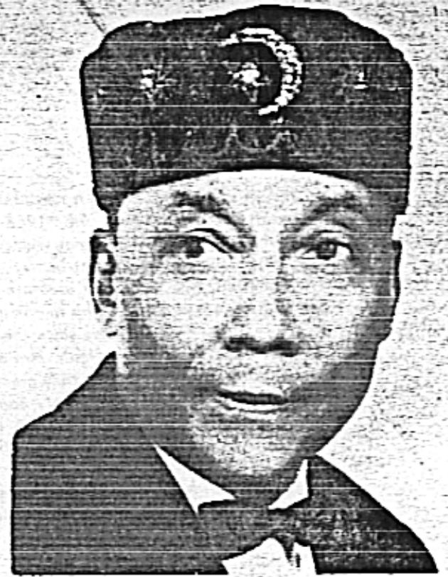
The Honorable Elijah Muhammad

HAVE YOU EVER NOTICED that everytime the enemy tries to interfere with the peace of the Muslims, God Retaliates against them in other lands and