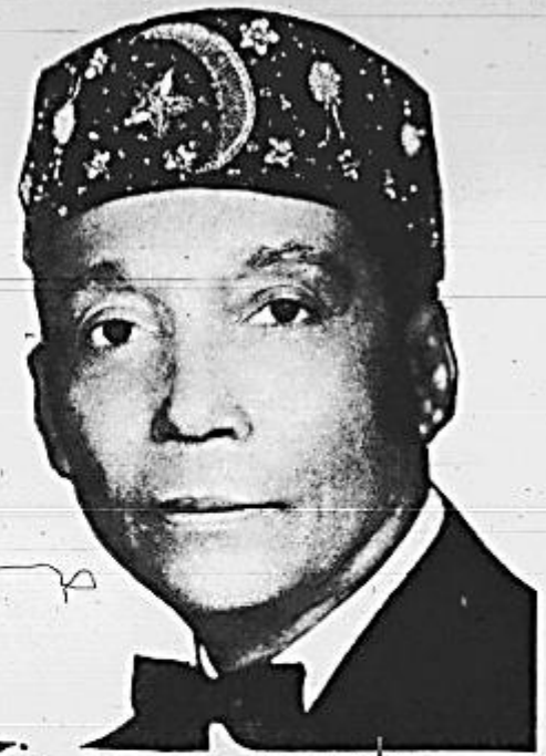
The Honorable Elijah Muhammad Messenger of Allah

YOU try to fight the white man, and then if he wounds you, you ask him to nurse your wounds, until you are able to go back and try to fight again. As civilized Black people we know that it takes a fool to do these things, but this is what you have already made of yourself. You want nothing of yourself, you only want what the white man offers to you.