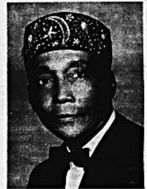
The Honorable Elijah Muhammad Messenger of Allah

THE WORLD OF CONFUSION is breaking up with all kinds of disagreement between factors and factors. Take for instance — never has America had so many strikes. Everyone is against the other. If this is not a CONFUSED WORLD, then point out to me one that is more confused.