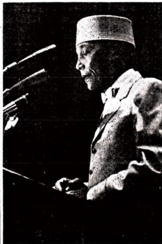
The Honorable Elijah Muhammad