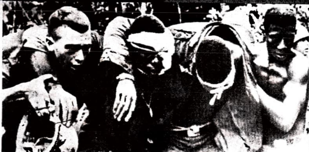
BLACK CASUALTIES steadily soar in disproportionate numbers of finding a job back in the U.S. diminishes every month, according to that of whites according to latest Pentagon data. Though according to the Labor Department, these Negro youths may not have to fight again, their chance