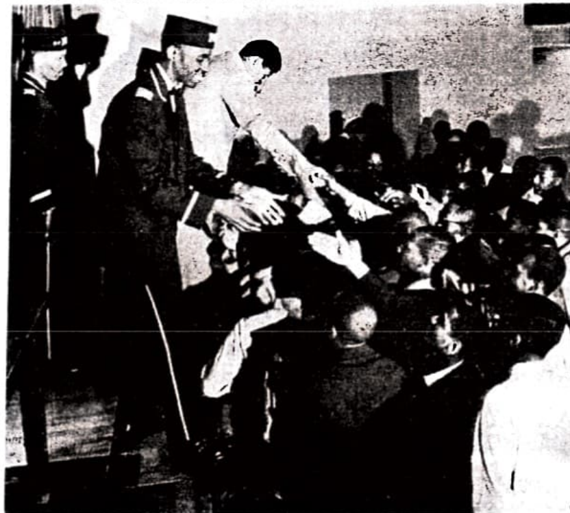
HANDS RAISED to greet the Ministers of Muhammad's Mosques of Islam thousands of black youths, such as these in the Washington, D.C. area have literally "risen from the dead" to embrace the teachings of Messen-