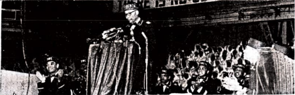
THE LIFE-GIVING MESSAGE of the Honorable Elijah Muhammad, delivered in an historic address before thousands at Chicago's Coliseum, still reverberates throughout the

But it will come to pass—and soon—that he shall see