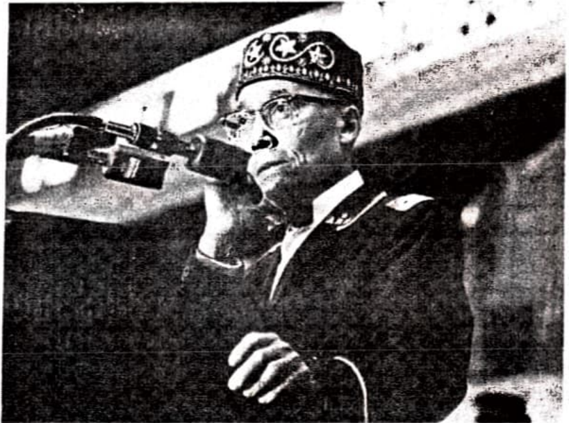
CALLING FOR UNITY among the 22 million black people of America, the Honorable Elijah Muhammad, last Messenger of Allah, thrilled world scholars, politicians, and statesmen with his solution, the only solution, for the problems besetting the black man.

The Museum conducts a school for the training of technicians at Jos, Nigeria, which is a joint venture with the United Nations Educational Scientific and Cultural Organization (UNESCO).