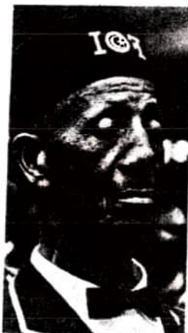
INTENSE appreciation of FOI member hearing the Honorable Elijah Muhammad, bringing the truth, is mirrored in the face of this proud black man.

in the new smooth and clear path. This is he that is talking. My eyes have been opened, to see these stones, that I may show them to my spiritually blind people so that they may not stumble and be snared in the trap of the enemy. There are a lot