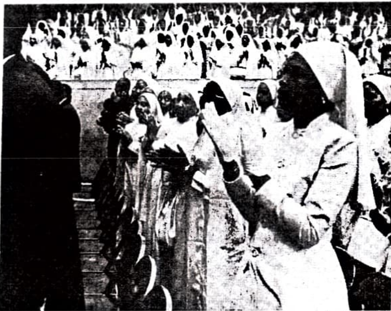
WOMEN OF ISLAM applaud the teachings of the Honorable Elijah Muhammad at Chicago's International Amphitheater. The Messenger of Allah pointed out that his people

had been brought down to their knees by the evil teachings of the white man and reminded them that it is his job to fight the World Serpent with the sword of Truth.