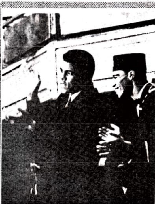
MUSLIM MINISTERS Muhammad Ali and Louis Farakhan of New York enthusiastically applauded the Honorable Elijah Muhammad as he delivers the Divine truth to the multitudes of black men who came to hear him at Chicago's International Amphitheater.