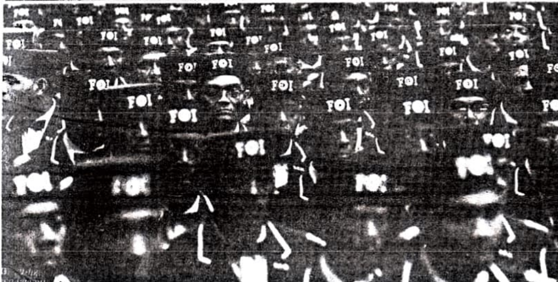
FRUIT OF ISLAM members form pattern of symmetry in Chicago's International Amphitheater where they came to hear the teachings of the Honorable Elijah Muhammad. These

HE SAID that if every black man in America would absent himself from work for one day, the power structure would seek some immediate solution to bring about first-class citizenship for black people who are presently second-class citizens.