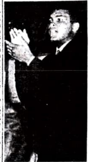
APPLAUDING THE MESSENGER of Allah after introducing him at Chicago's International Amphitheater, Muhammad Ali, world heavyweight champion attributes his phenomenal popularity to his Islamic faith and his strict adherence to the teachings of the Honorable Elijah Muhammad.

You may ask me to prove it. The fundamental principles of belief in Christianity is that you must believe in three Gods — that's false. Moses was not taught to be-