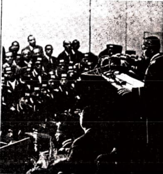
GOD-SENT LEADER of America's 22 million black people, the Honorable Elijah Muhammad, addresses hundreds of followers and visitors at Chicago's International Amphitheater. The Messenger of Allah called for a birth of black dignity and truth to oppose teachings of the "World Serpent" who is attempting to deceive the black man with a form of adulterated Christianity.

IT SHOWS THAT he must not have had too much knowledge of himself, for