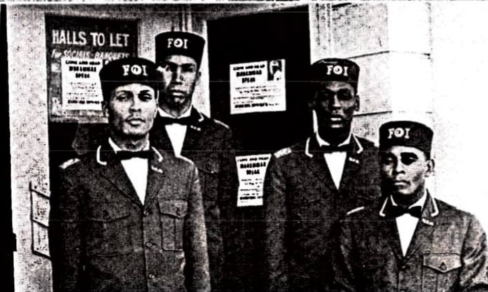
MODERN COMMUNICATIONS technology made it possible for these brothers in San Francisco to present the message of the Honorable Elijah Muhammad who was speaking in