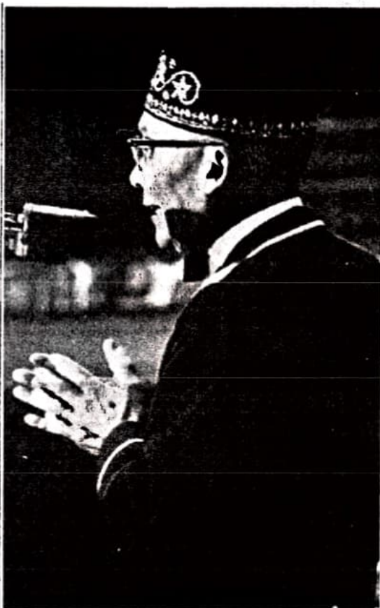
"I HAVE Been Risen Up To Tell You The Truth"

This is the truth that you must know my people. Christianity is a religion that the white people made — its an organized religion — not a religion by nature. The nat-